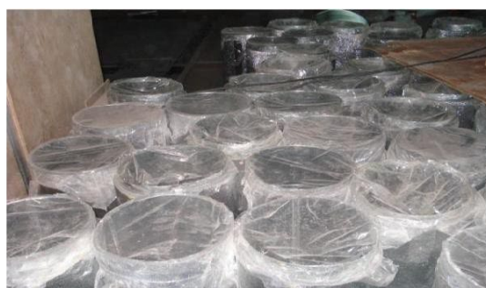
Ducts Stored with Properly Wrapped with Plastic