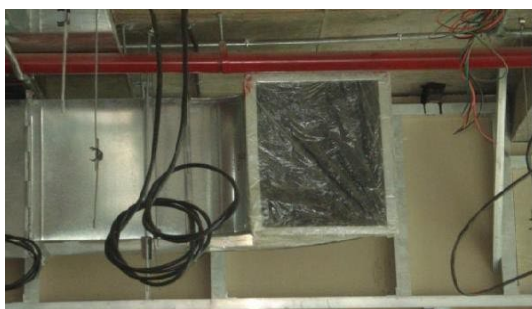
Ducts Wrapped With Plastic To Avoid Dust

Note: The below photographs are given just for reference purpose, they do not refer to any specific brands/makes.