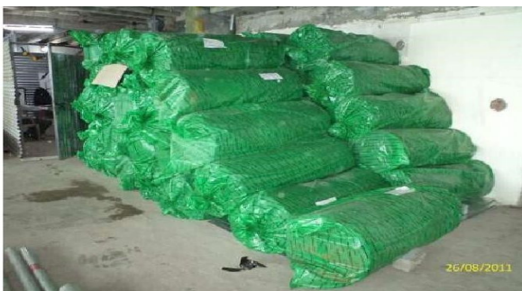
Equipment Covered during Construction Phase