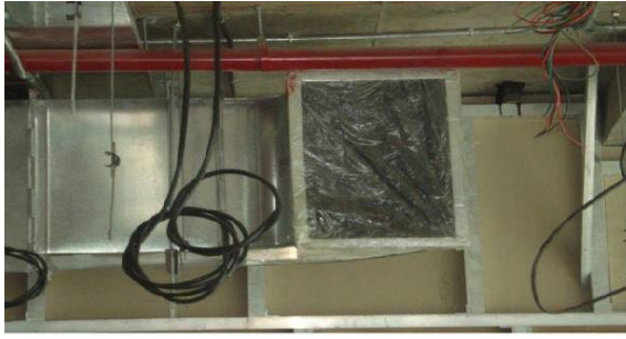
Ducts Wrapped With Plastic to Avoid Dust

Note: The below photographs are given just for reference purpose, they do not refer to any specific brands/makes.