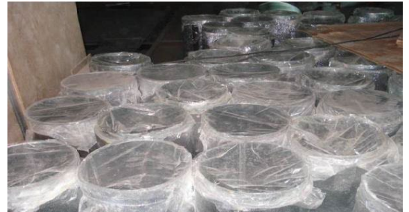
Ducts Stored with Properly Wrapped with Plastic