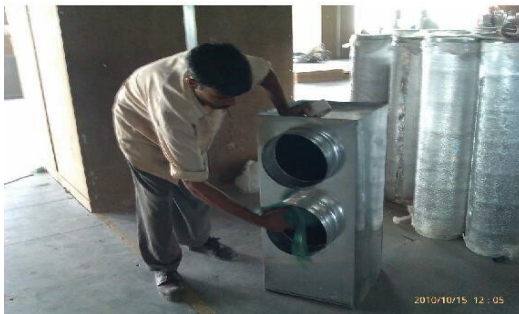
Cleaning Prior To Installation